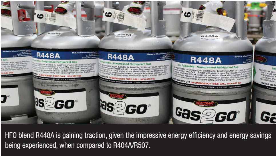
HFO blend R448A is gaining traction, given the impressive energy efficiency and energy savings being experienced, when compared to R404A/R507.

In a recent R448A refrigerant retrofit trial carried out in a Victorian commercial refrigeration application, the new HFO blend delivered positive results paving the way for a viable solution in the ongoing management of the business's R404A/R507 refrigeration plant.